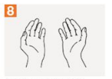
Once dry, your hands are safe.